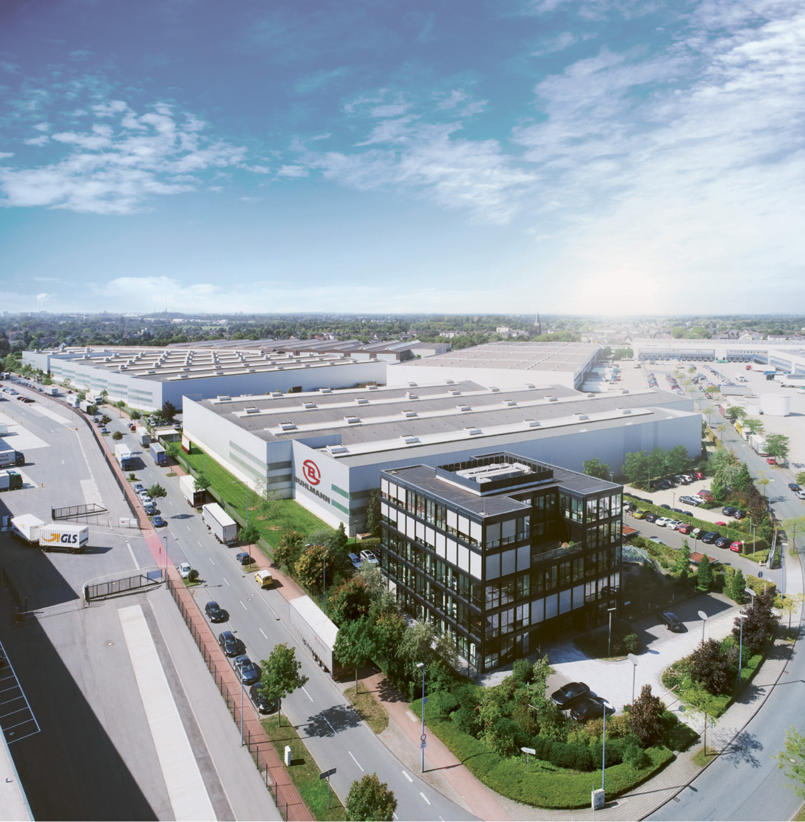
Location in Duisburg

BUHLMANN Rohr-Fittings-Stahlhandel GmbH + Co. KG Arberger Hafendamm 1 · 28309 Bremen · Germany Telephone +49 421 45 86 - 0 bremen@buhlmann-group.com