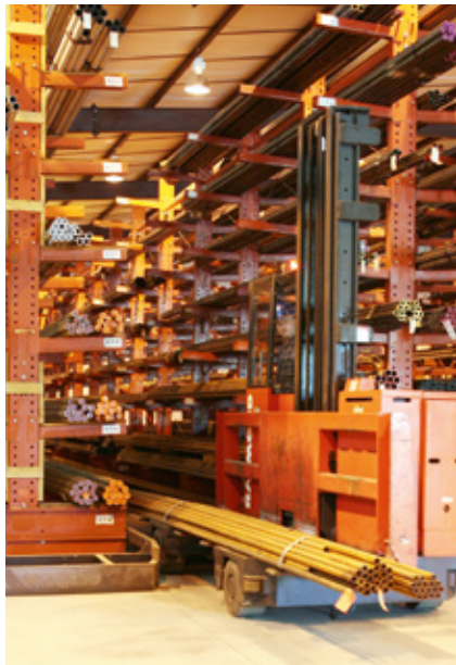
> View of the warehouse of R-S Matco

R-S Matco's customers include coal and gas fired powerplants, pulp and paper industries, petro-chemical industries, industrial and commercial boilers, sugarmills, waste heat boilers and package boilers. At R-S Matco we put our customers first – on the company's website this as a clearly defined testimonial. And the company emphasizes: "We are available anytime; 24 hours a day, 7 days a week. That's what makes us special: We are always there for our