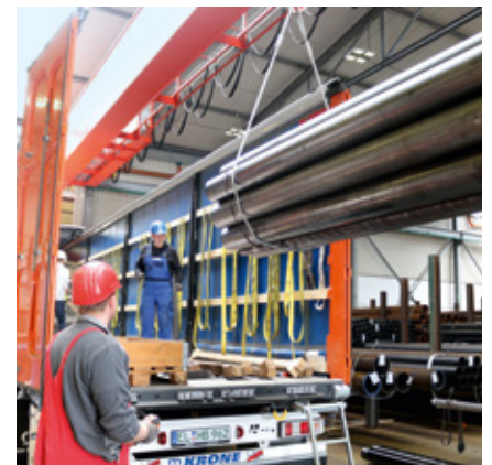
Strict supervision during loading

Approximately 2000 pipes per month are cut to length. And not merely that: The stainless steel pipes are also polished with a cloth and then wrapped