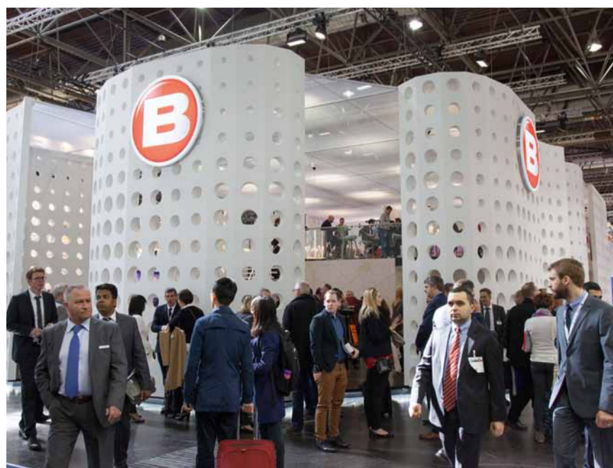
The new BUHLMANN booth will be at the TUBE 2018 again this year

Want to convince yourself of the BUHLMANN GROUP trade fair appearance? Then you can look forward to the typical BUHLMANN flair with excellent hospitality and enough space for a quiet exchange in Hall 3, booth A20.