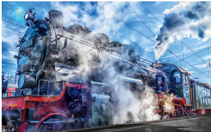
The BUHLMANN GROUP opens up a new field of activity: locomotive

BUHLMANN GROUP is pleased to announce additions to the Projects department. After lengthy negotiations, it has been possible to acquire